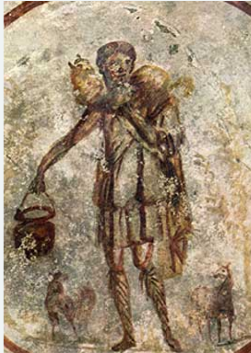
At the Catacomb of Priscilla, Rome, 3 rd Century